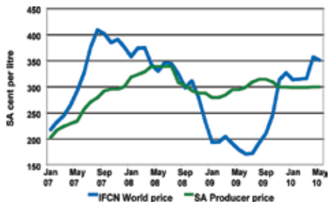
FIGURE 2: South African milk : feed price ratio based on SAFEX price quotes and list price of basic dairy meal